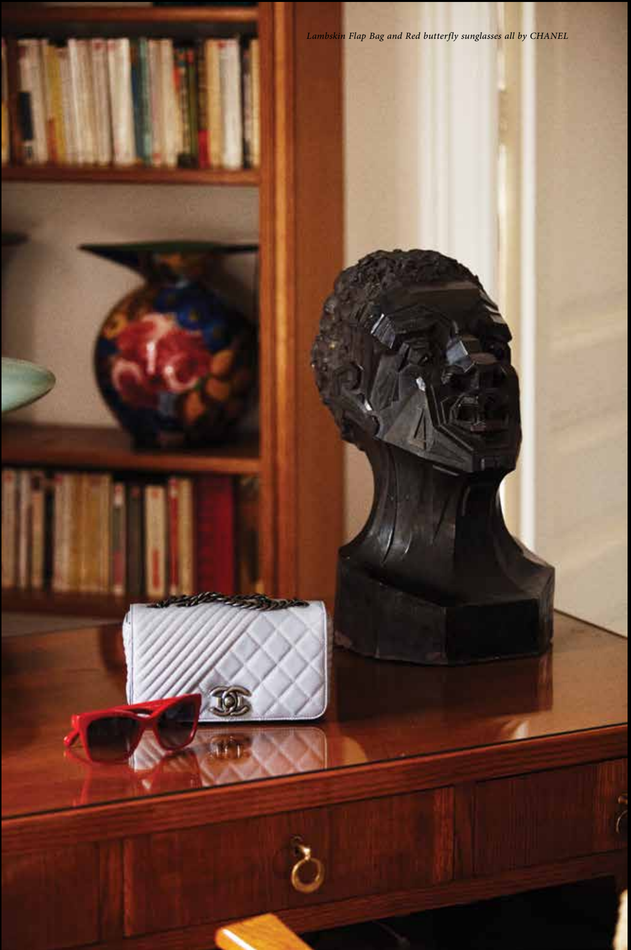
Lambskin Flap Bag and Red butterfly sunglasses all by CHANEL