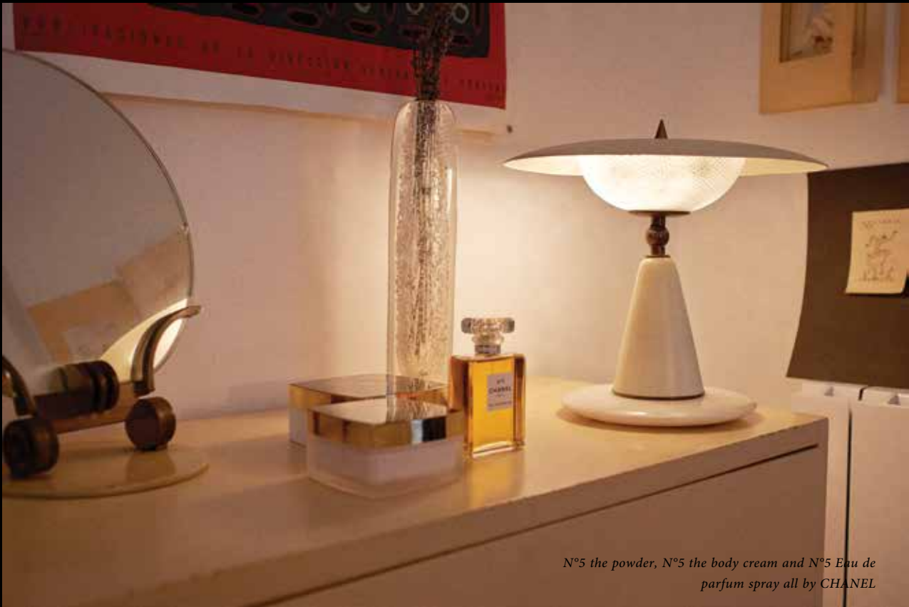
N°5 the powder, N°5 the body cream and N°5 Eau de parfum spray all by CHANEL