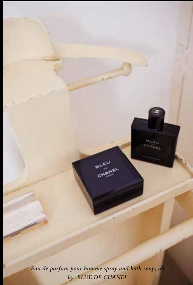
Eau de parfum pour homme spray and bath soap, all by BLUE DE CHANEL