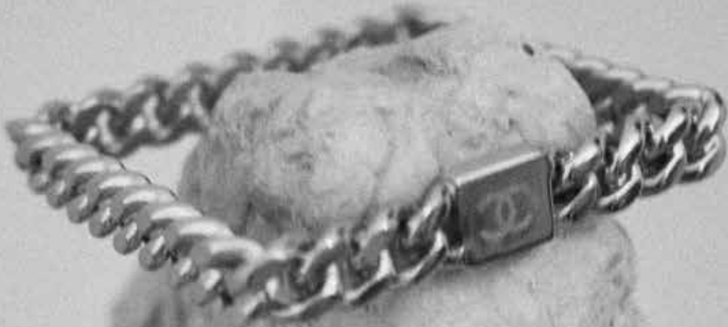
Metal square logo bangle by CHANEL