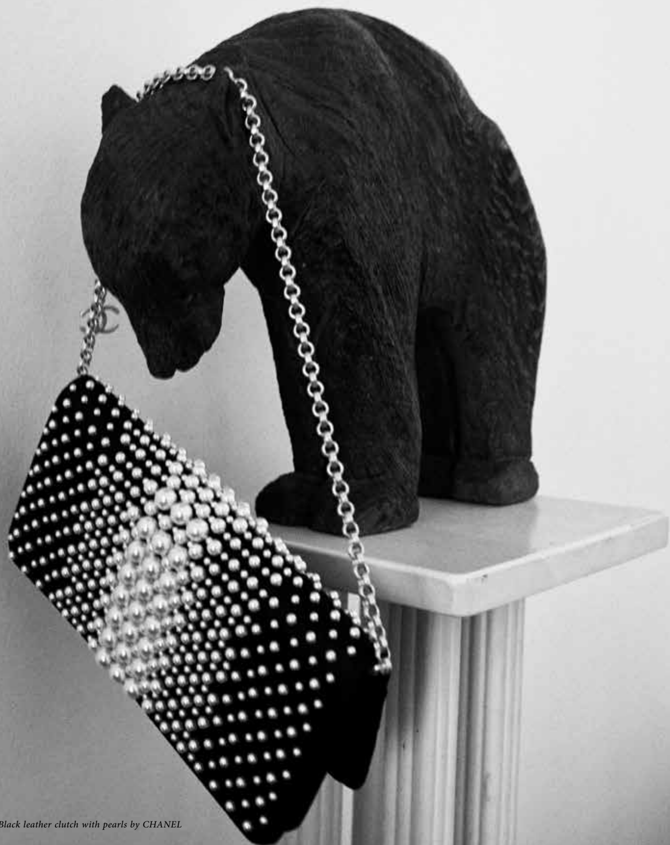
Black leather clutch with pearls by CHANEL